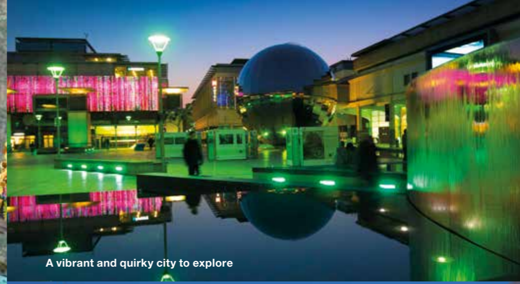
A vibrant and quirky city to explore