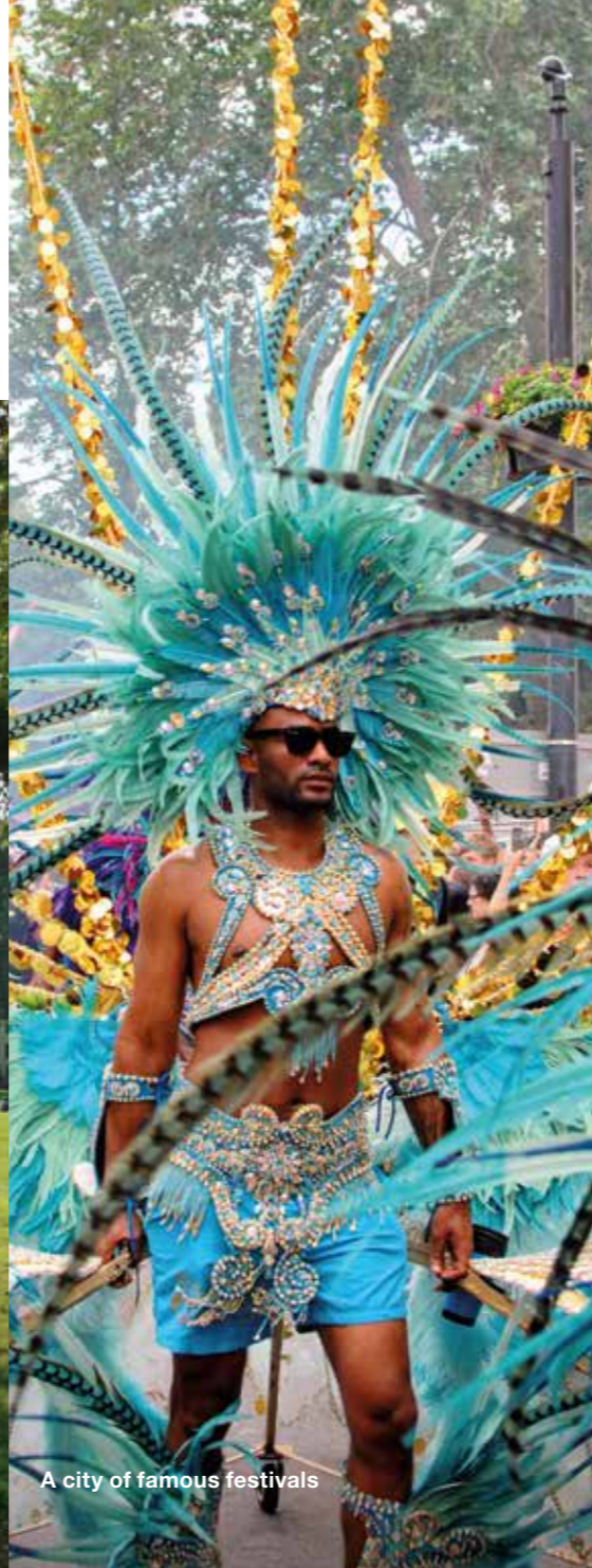
A city of famous festivals

Find more images of student life in our city @universityofbristol