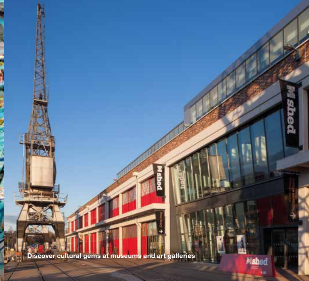
Discover cultural gems at museums and art galleries