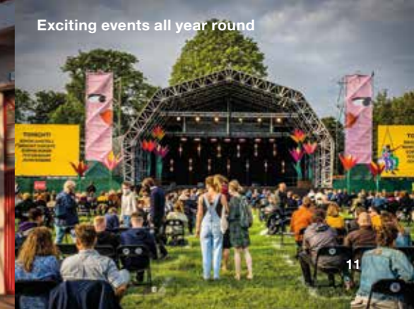
Exciting events all year round