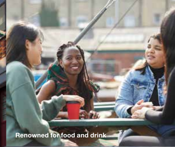
Renowned for food and drink