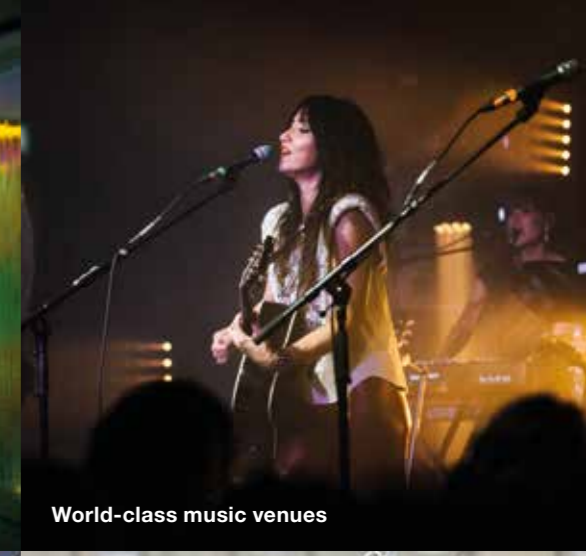
World-class music venues