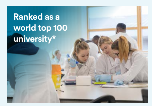
*QS World University Rankings 2019

The academic year in the UK runs from September to June. We work on a semester system so the autumn semester (semester one) runs from September to January and the spring semester (semester two) runs from January to June. We have two vacation periods: one at Christmas (December/January) and one at Easter (March/April). For more information, please see: nottingham.ac.uk/about/keydates