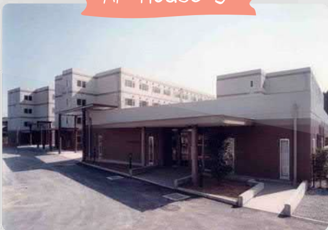
AP House 3