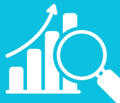
DATA SCIENCE & INFORMATION SYSTEM