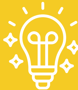
ENTREPRENEURSHIP AND OPERATIONS MANAGEMENT