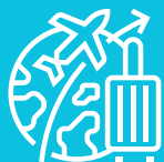
TOURISM INDUSTRY OPERATIONS