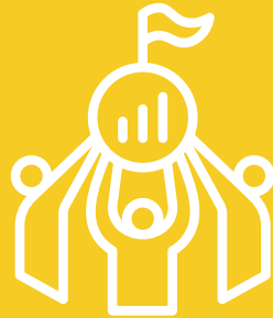
STRATEGIC MANAGEMENT AND LEADERSHIP

APM offers the Major Courses Related to the Following Areas of Study