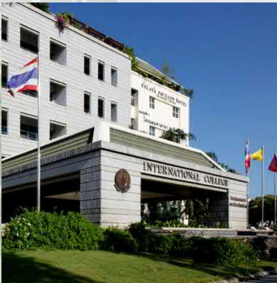
MUIC Building 1