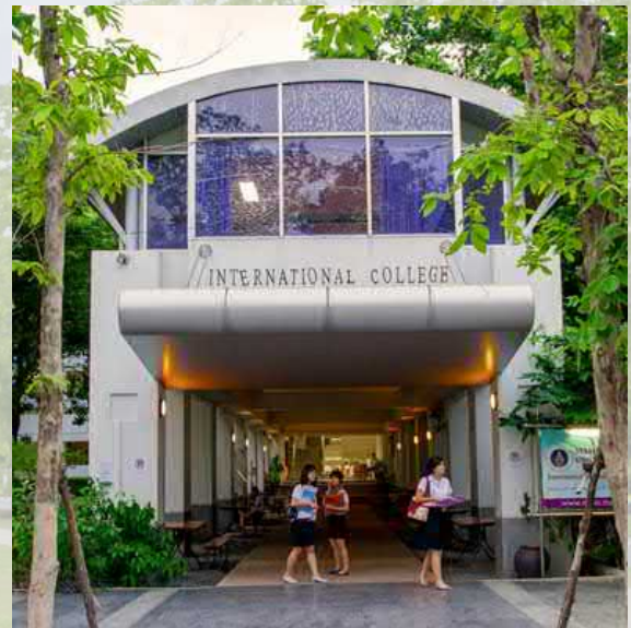
MUIC Building 2